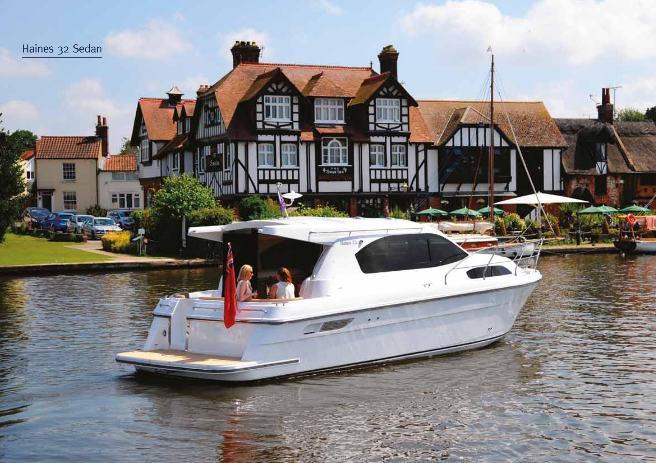
Haines 32 Sedan